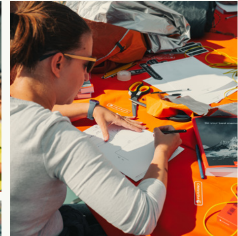
First Workshop at the Mountain Museum of Torino